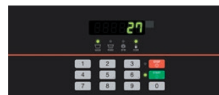
Quantum™ Gold Control