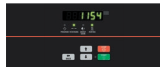
Quantum™ Gold Control

*See below all model numbers depending on local agencies approval