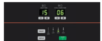
Dual Digital Control